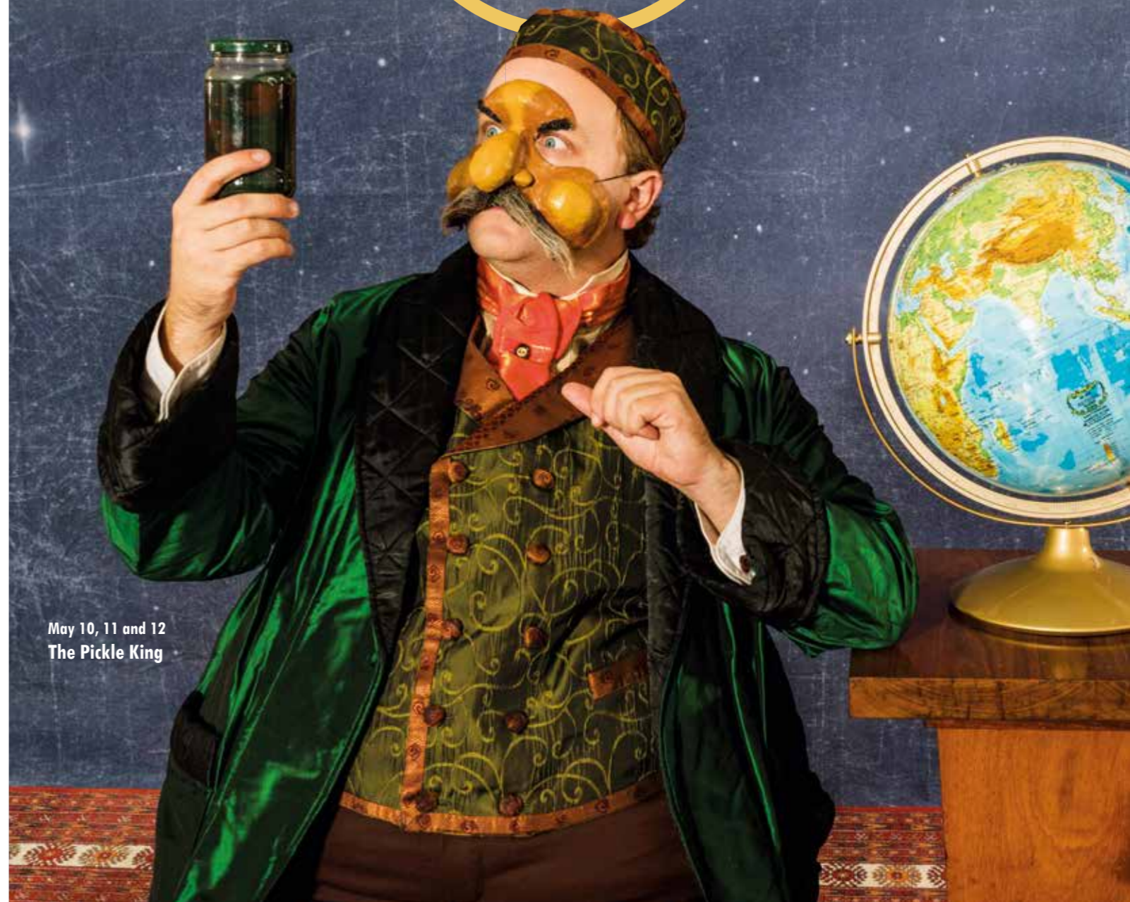
May 10, 11 and 12 The Pickle King